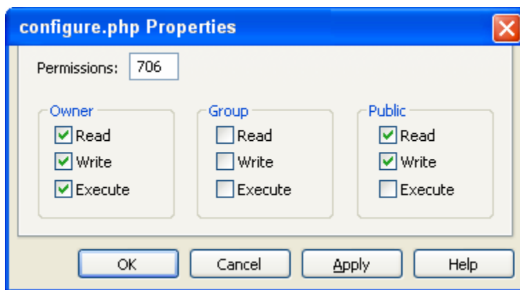
An FTP Program with permissions set to 706.

/includes/configure.php /admin/includes/configure.php